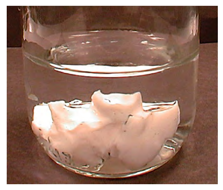
Krytox® grease in hydrocarbon solvent is not dissolved.