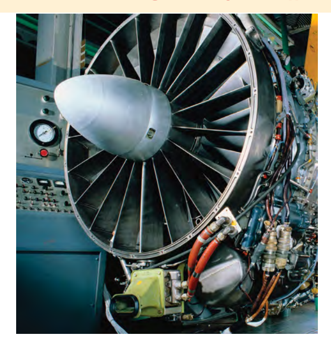
XHT Grades: Extreme Conditions, Extreme Performance