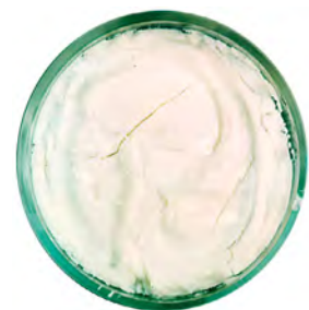
In oven at 232 °C (448 °F) for 40 hr: Krytox® – 0% wt loss

Krytox® lubricants are more effective at even higher temperatures, regardless of operating duration. Using base oils, thickeners, and additives with chemistry designed to create high and low viscosity, these products are targeted for use solely in the very high-temperature range. Available in several grades that offer anticorrosion, extra bonding, and non-melting properties, these lubricants have applications in a variety of industries, including chemical, textile, tire, aviation, conveyor, glass, plastic film, nonwoven manufacturing, and mining and metal processing.