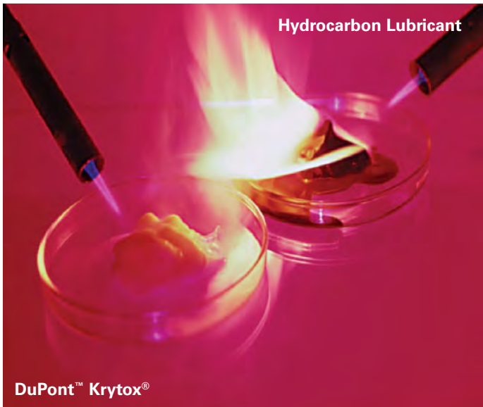
Hydrocarbon-based lubricants burn; Krytox® does not.