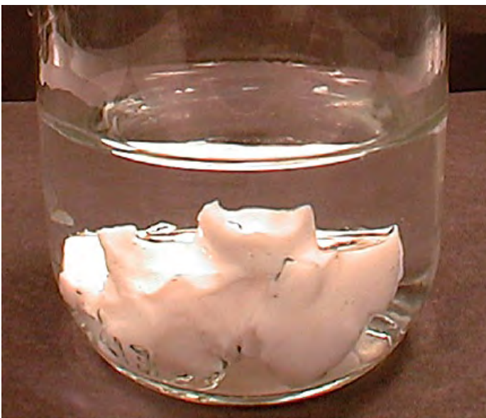
Krytox® grease in hydrocarbon solvent is not dissolved.