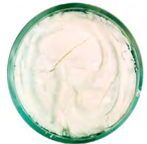
In oven at 232 °C (448 °F) for 40 hr: Krytox®—0% wt loss

Krytox® lubricants are more effective at even higher temperatures, regardless of operating duration. Using base oils, thickeners, and additives with chemistry designed to create high and low viscosity, these products are targeted for use solely in the very high-temperature range. Available in several grades that offer anticorrosion, extra bonding, and non-melting properties, these lubricants have applications in a variety of industries, including chemical, textile, tire, aviation, conveyor, glass, plastic film, non-woven manufacturing, and mining and metal processing.