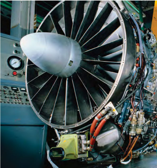
XHT Grades: Extreme Conditions, Extreme Performance