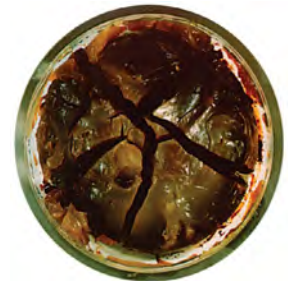
In oven at 232 °C (448 °F) for 40 hr: Hydrocarbon—40% wt loss